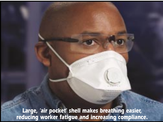
Large, 'air pocket' shell makes breathing easier, reducing worker fatigue and increasing compliance.