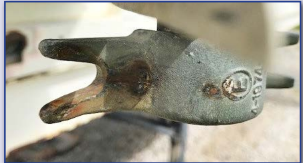
Heavy metal projectile that struck the Conqueror lens

"There was a mechanical failure on the jobsite today and an extremely heavy, and potentially deadly (or at minimum life-altering) sharp piece of metal struck my Gateway Safety glasses at a high rate of speed."