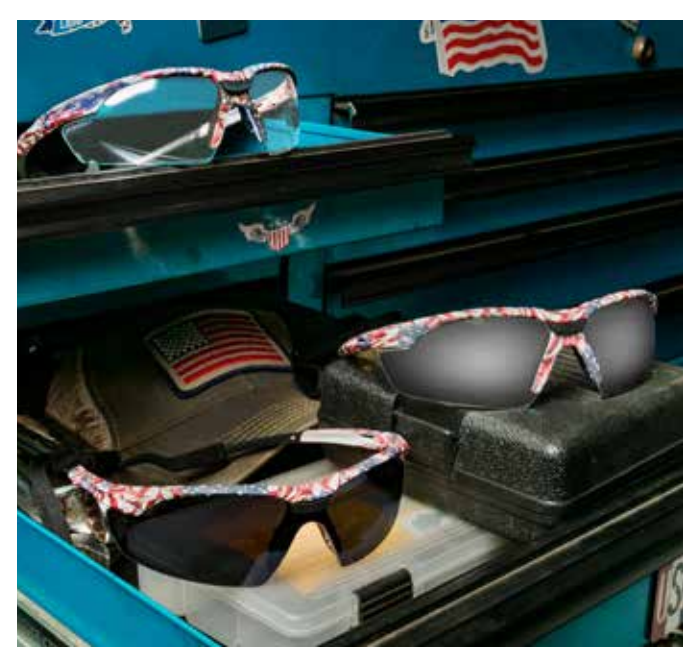
Gateway Safety's exclusive Old Glory camo frame is perfect for the all-American worker. Proud. Strong. Patriotic.