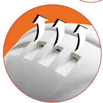
CoolSense™ Air Flow System on vented Serpent lets heat escape, keeping workers cooler.