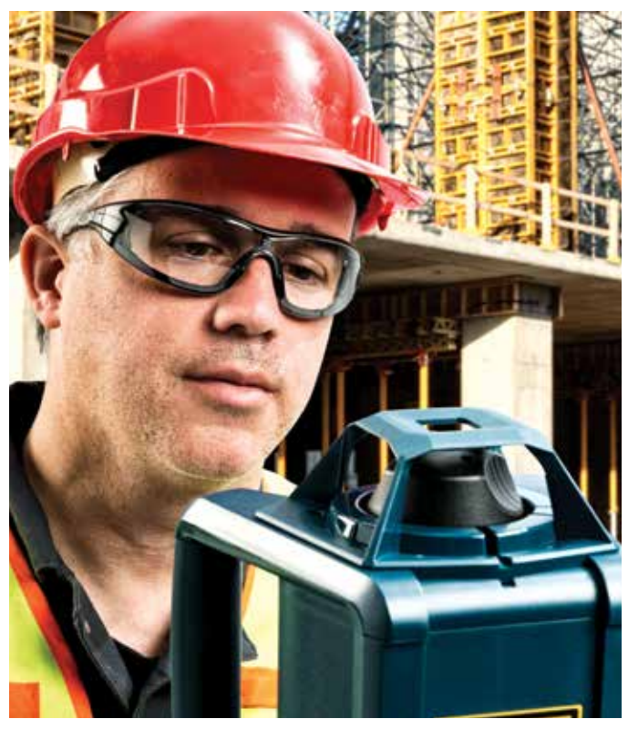
Swap MAG provides a bifocal solution in either a spectacle or goggle product.