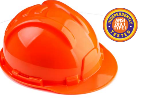
Gladiator II Safety Helmet (#72304)